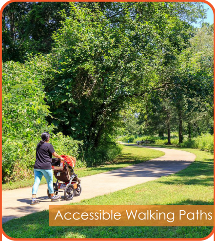
Accessible Walking Paths