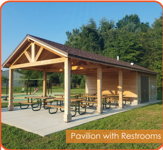
Pavilion with Restrooms