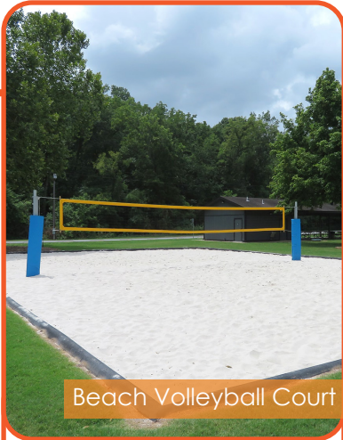
Beach Volleyball Court