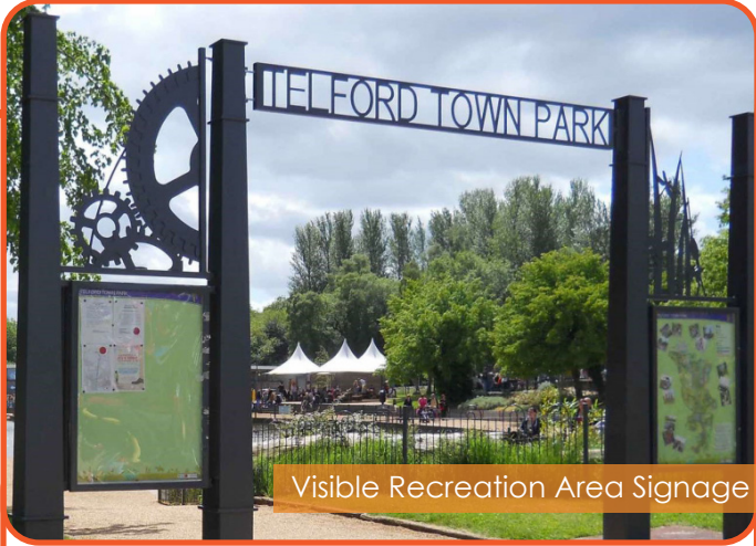
Visible Recreation Area Signage