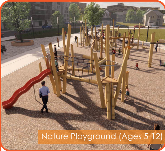
Nature Playground (Ages 5-12)