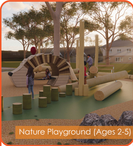
Nature Playground (Ages 2-5)