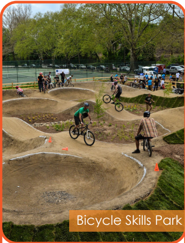
Bicycle Skills Park