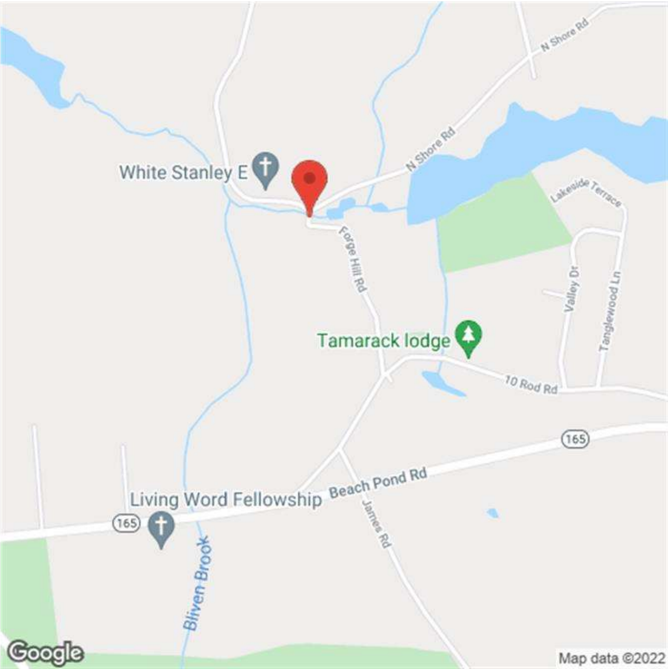
Location Map # 1

Town: VOLUNTOWN Carried: FORGE HILL ROAD Crossed: PACHAUG RIVER Inventory Route: Non-NHS